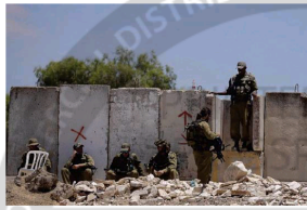
Israeli soldiers rest at the site of a vehicle attack Wednesday near Hitzme Junction in the West Bank. The Israeli military shot and killed a Palestinian woman who it said tried to ram her car into a group of soldiers.