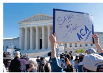
The Supreme Court, by a 7-2 margin, preserved health coverage for millions of Americans on Thursday.