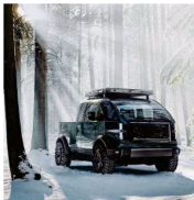
ABOVE: This Canoo pickup is planned for delivery starting in 2023.

TOP: The Canoo Lifestyle Vehicle is described as a spacious, pod-like minivan that can seat up to seven. A pickup version is also planned, along with a multipurpose delivery vehicle.